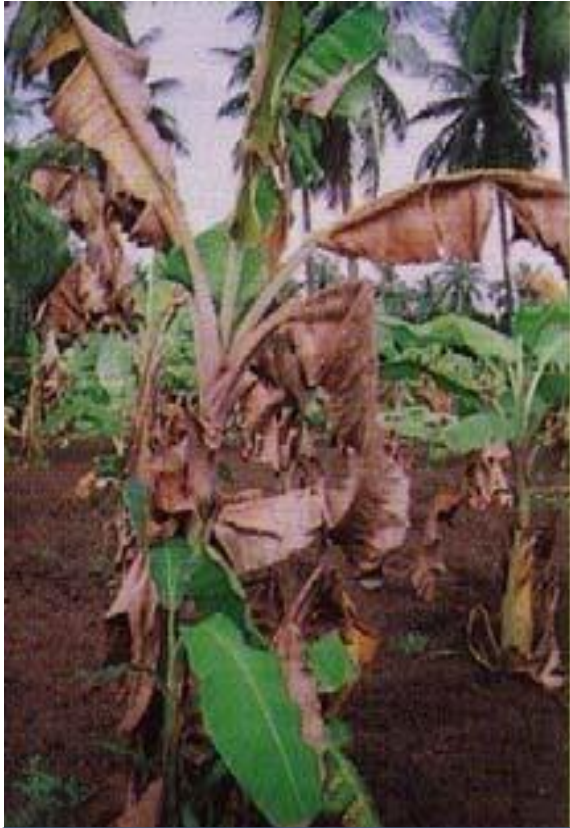
WILTING SYMPTOM ON WHOLE PLANT