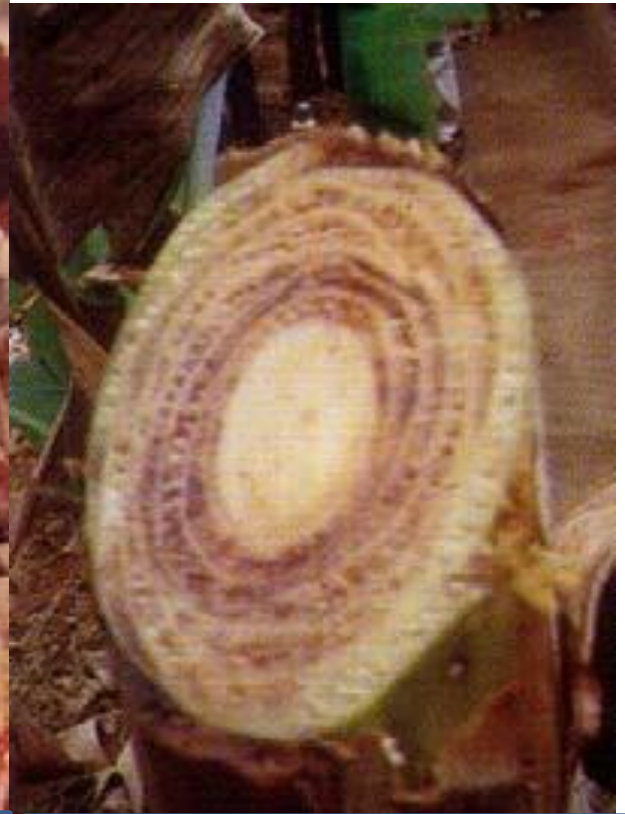
BLACK COLOUR APPEARANCE OF VASCULAR BUNDLE