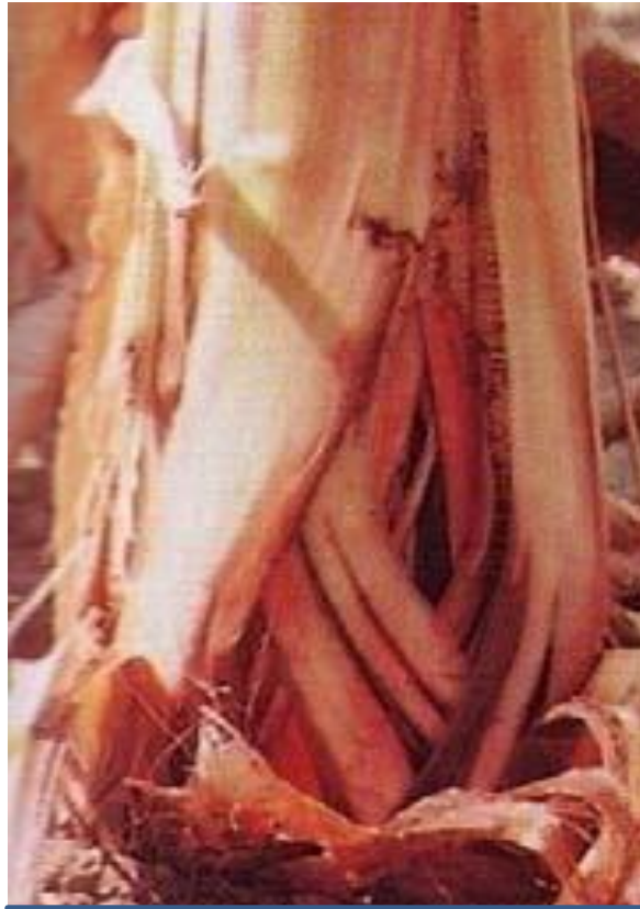
LONGITUDNAL SPLITTING ON STEM