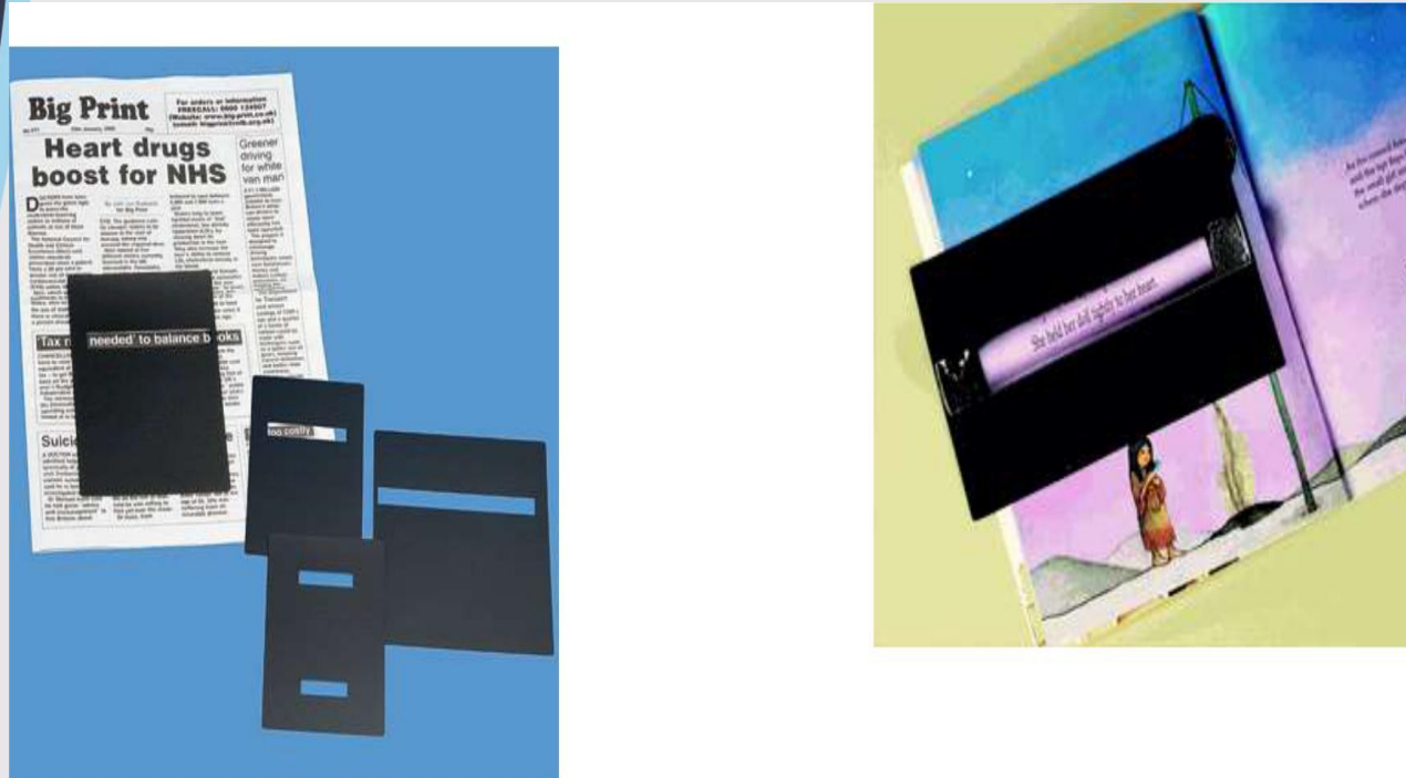
Fig 17 TYPOSCOPE