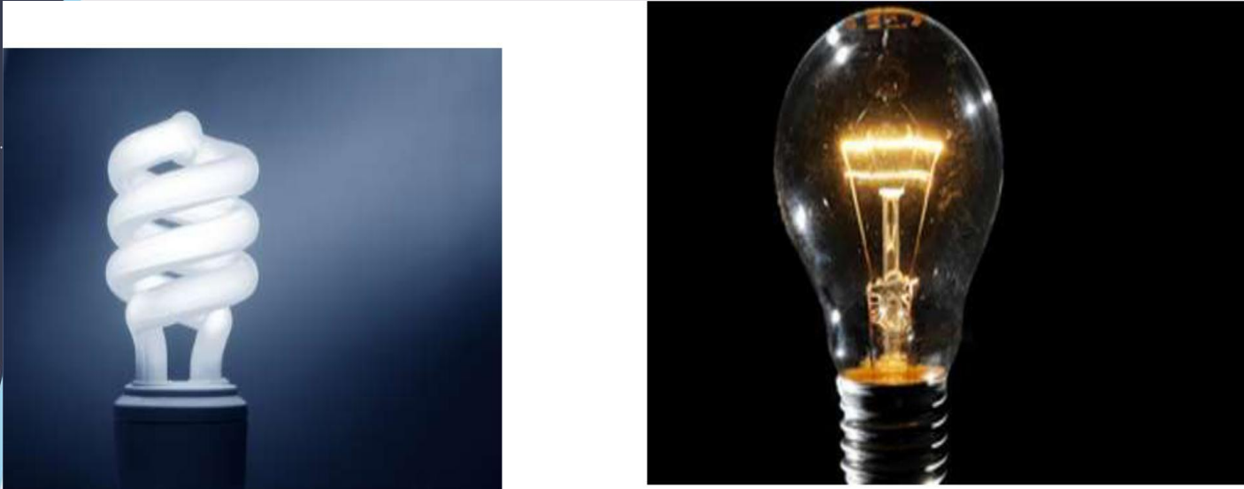
Fig: 16 GLARE , CONTRAST AND LIGHT CONTROL

Shaping Lives... Empowering Communities.