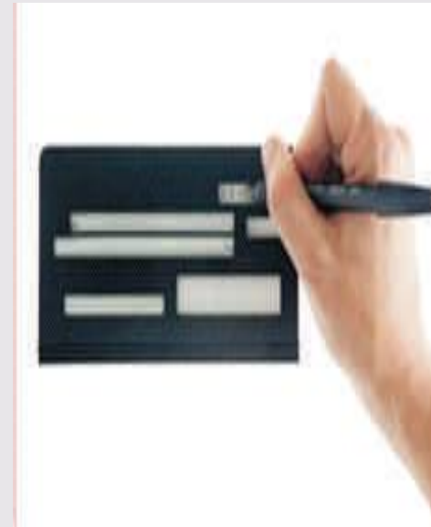
Fig no :6 Cheque guide