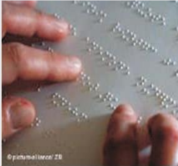
Fig no :9 Braille