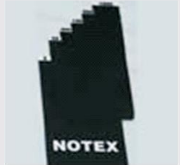
Fig no :10 Notex