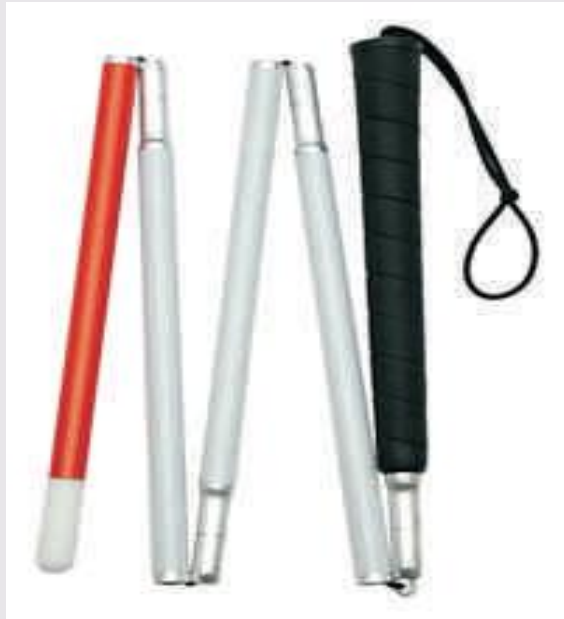
Fig no 7 cane