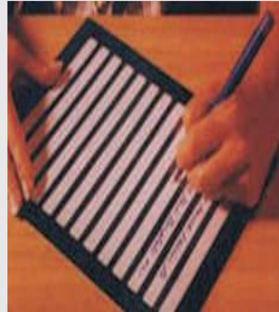
Fig no :8 Letter writer