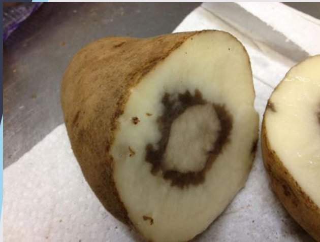
Black heart 16