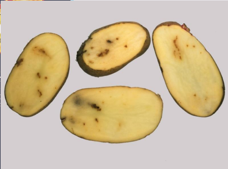
Internal brown spot