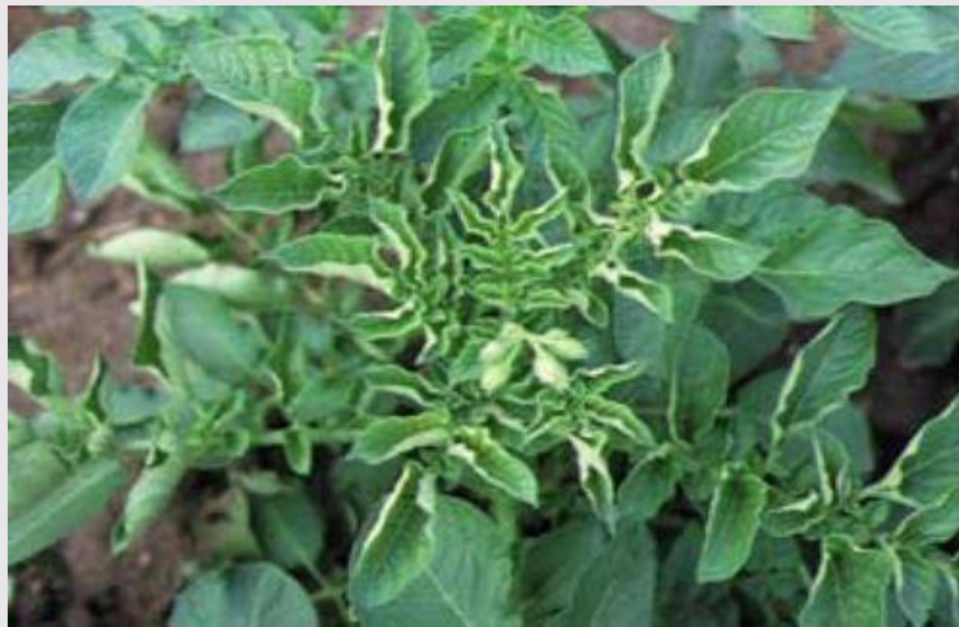
Potato leaf roll