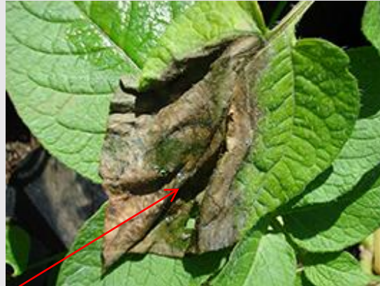
Late blight of potato