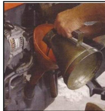
Adding oil in the engine sump