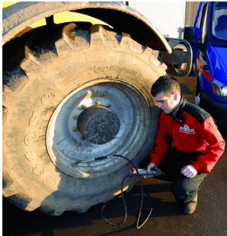
View of tyre pressure checking of tractor