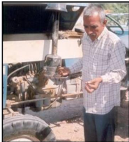
Checking engine oil level with dipstick