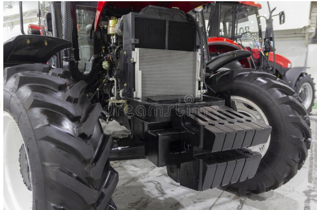
View of oil bath type air cleaner