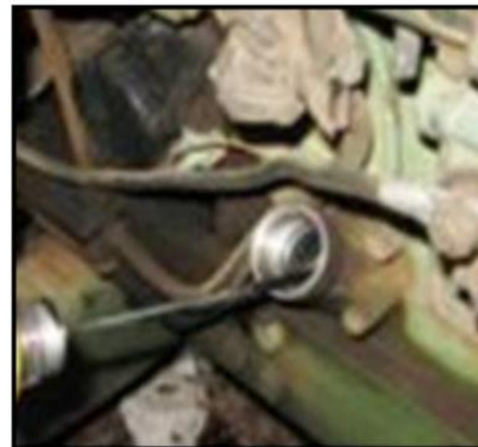
Dip stick in open position