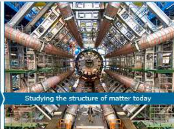
Studying the structure of matter today