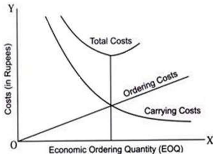
Fig. 1: Economic Order Quantity Graph