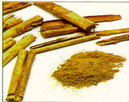
Cinnamon Cinamomum cassia