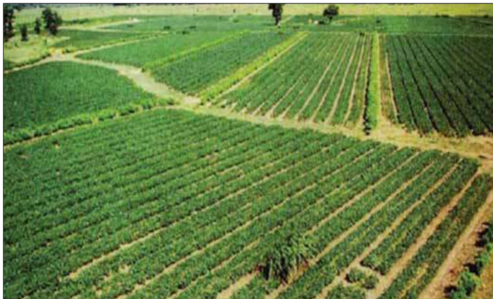
Figure 3. Broad band and furrow practices ( in-situ management). Photo: (BW7 watershed) at ICRISAT, Patancheru.

Soil and water conservation practices are the primary step of watershed management program. Conservation practices can be divided into two main categories: 1) in-situ and 2) ex-situ management. Land and water conservation practices, those made within agricultural fields like construction of contour bunds, graded bunds, field bunds, terraces building, broad bed and furrow practice and other soil-moisture conservation practices, are known as in-situ management (Figure 3). These practices protect land degradation, improve soil health, and increase soil-moisture availability and groundwater recharge. Moreover, construction of check dam,