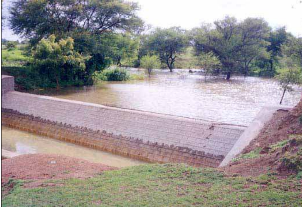
Figure 4. Water stored in check dam built across the stream channel (ex-situ management); Photo: Kothapally watershed.

farm pond, gully control structures, pits excavation across the stream channel is known as ex-situ management (Figure 4). Ex-situ watershed management practices reduce peak discharge in order to reclaim gully formation and harvest substantial amount of runoff, which increases groundwater recharge and irrigation potential in watersheds.