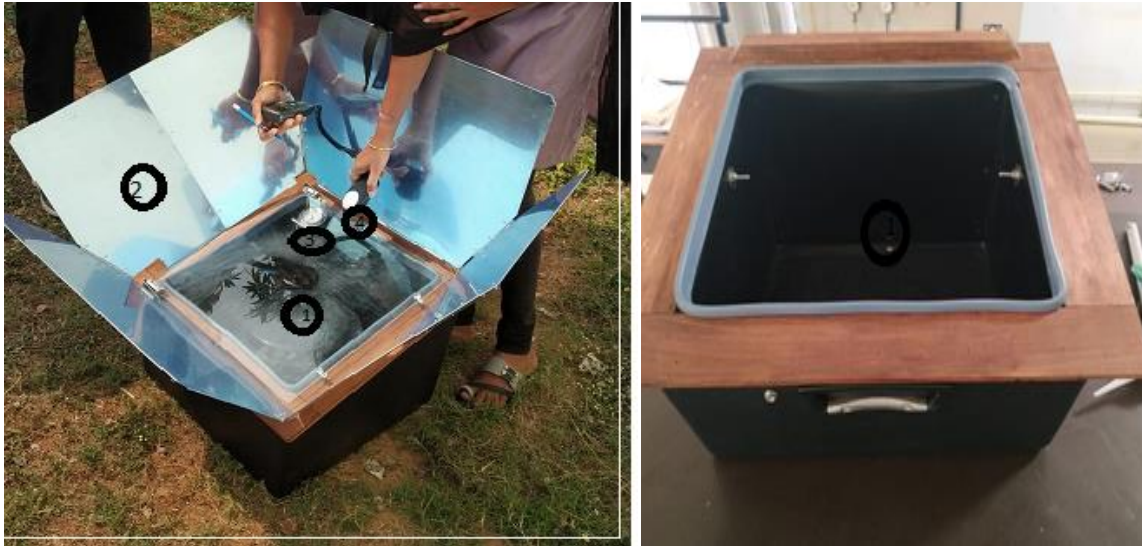
Figure 1. Experimental setup of Solar box type of cooker. (1). Transparent or cover plate, (2) Reflector(4 numbers), (3).Temperature sensor, (4) Lux meter.