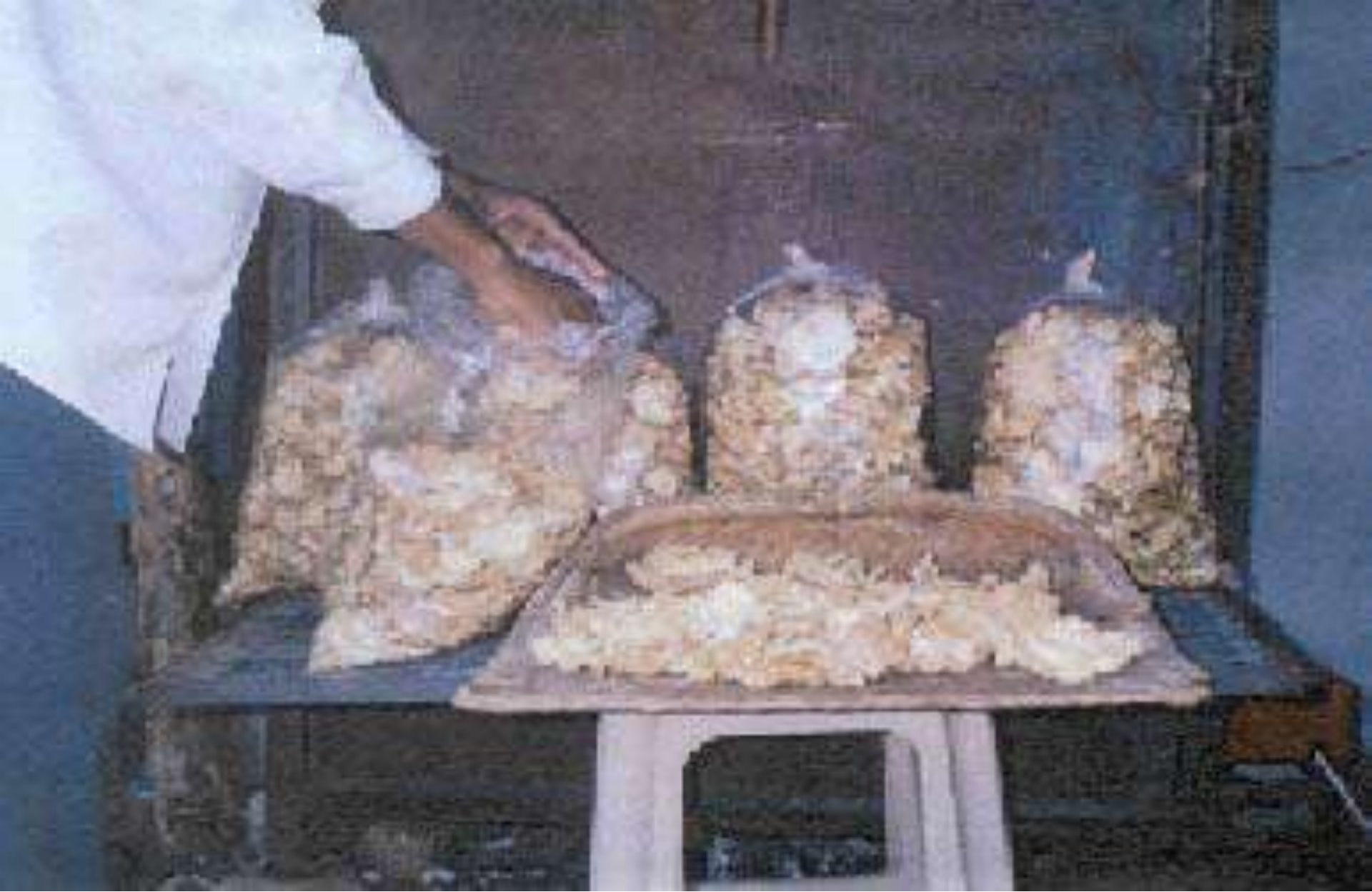
Mushroom packing in polypouches