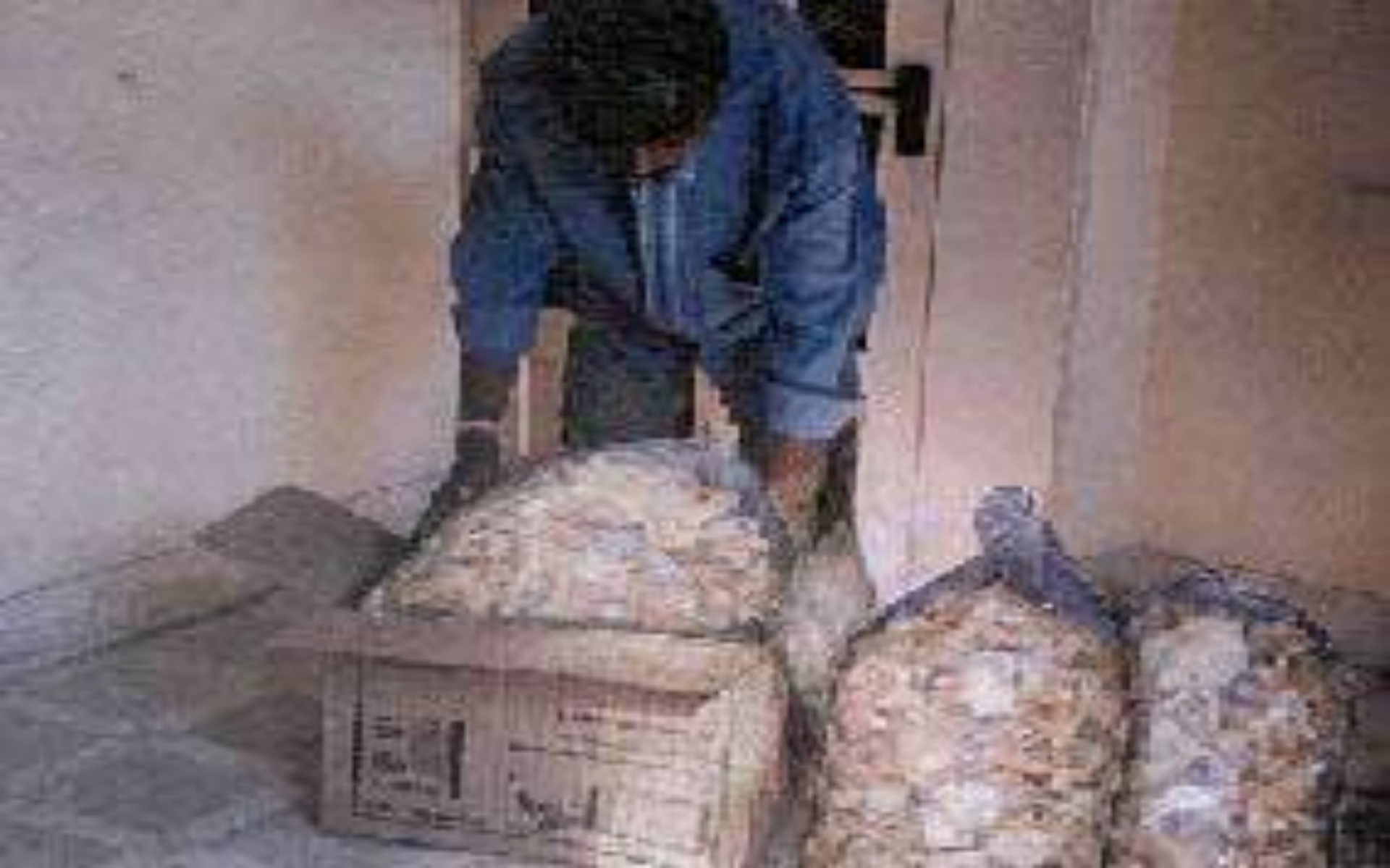
Mushroom packing in cartons