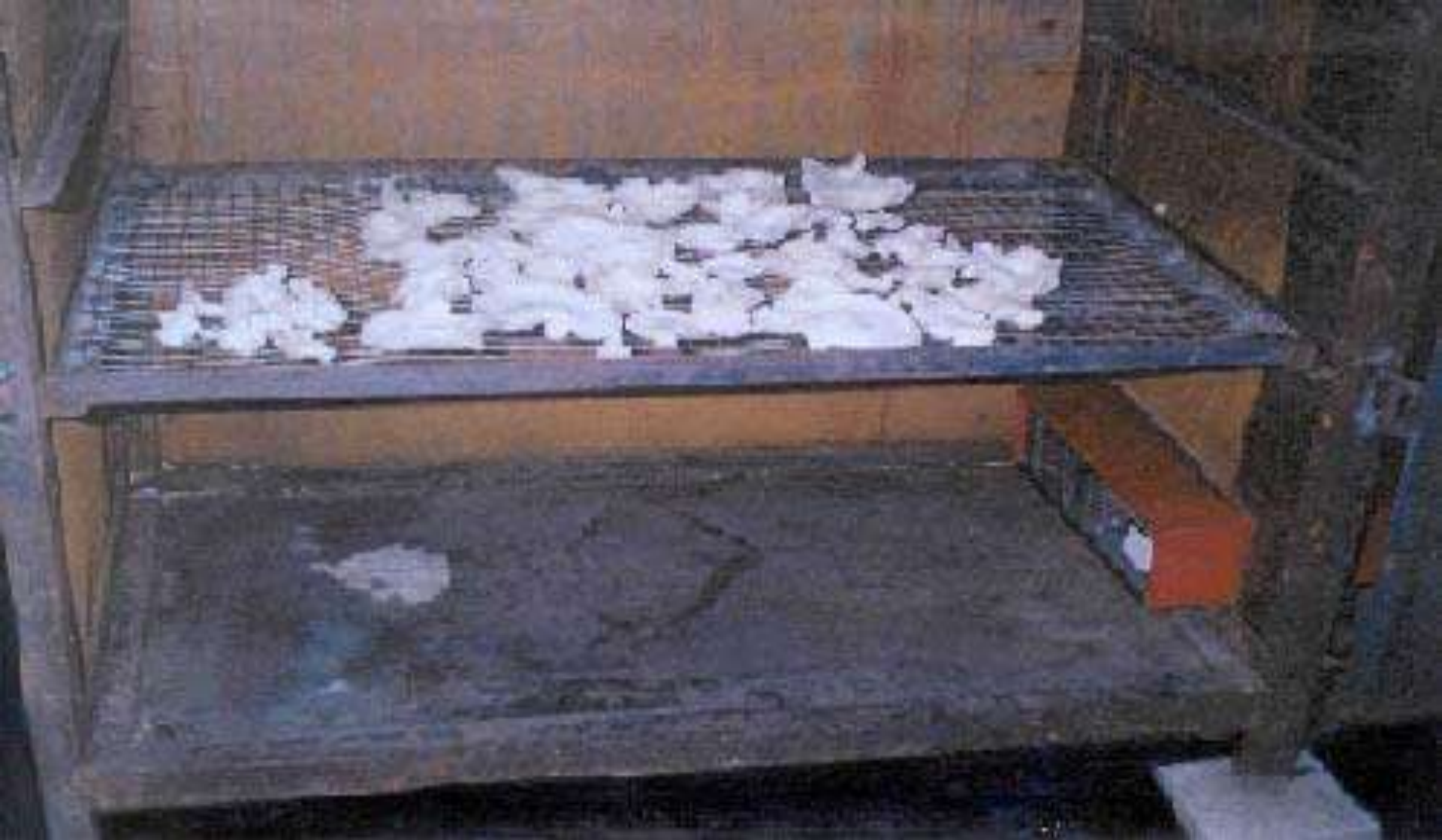
Drying of mushroom