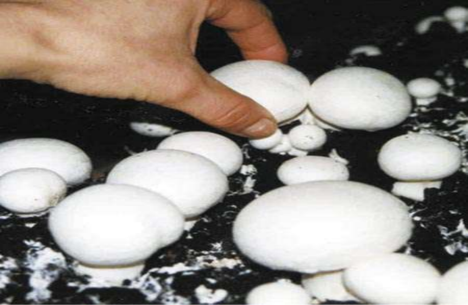
Harvesting of button mushrooms