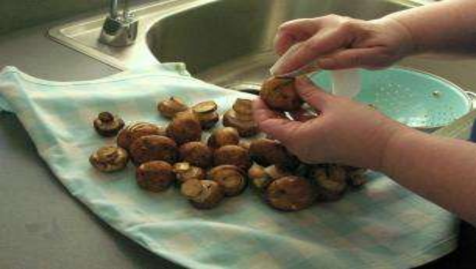
Cleaning of mushroom