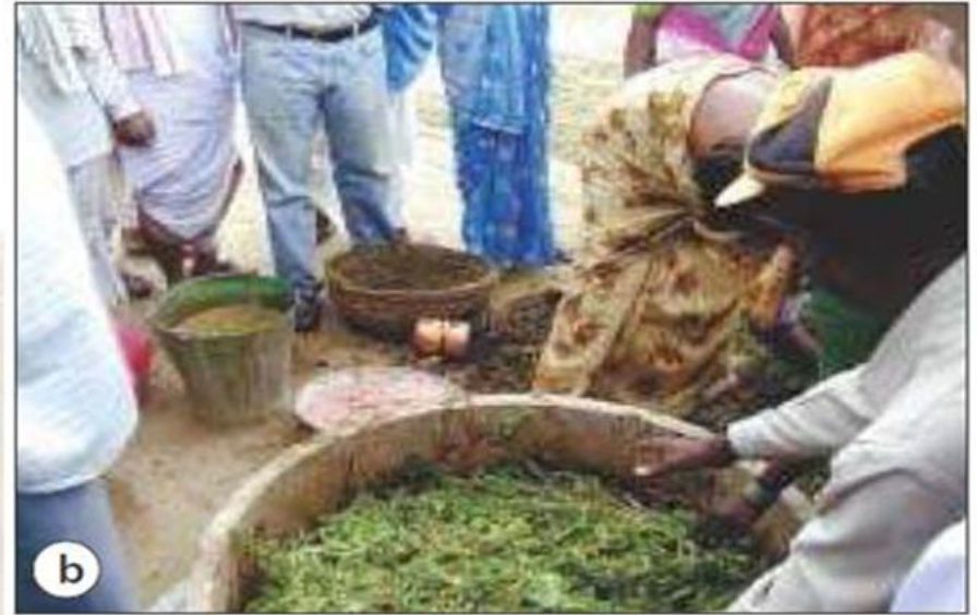
Layer of raw material placed on polythene sheet