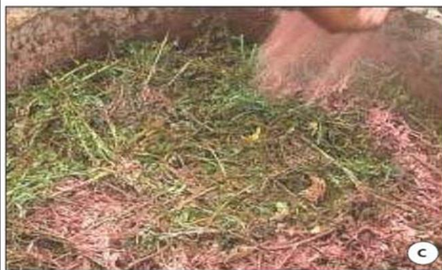
Rock phosphate powder sprinkled on organic material