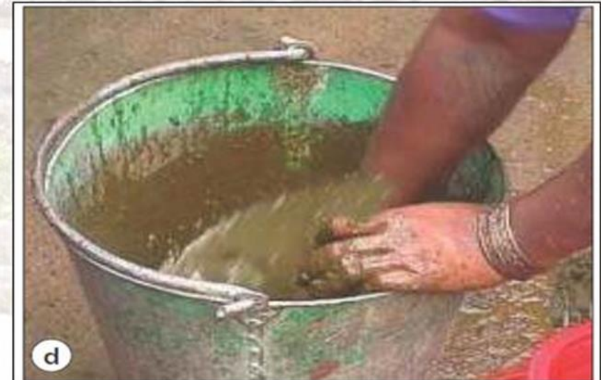
Cow dung slurry