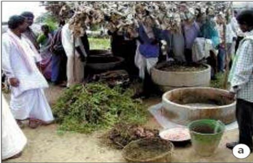
Plastic sheet placed below the ring