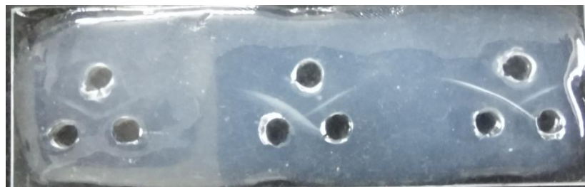
X Pattern of Identity Y Pattern of Partial Identity Z Pattern of Non Identity

Observe for presence of precipitin lines between antigen and antisera wells. Note the pattern of precipitin line observed in each case.