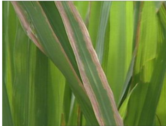
Fig. 7.6. Bacterial blight of paddy

E.g Bacterial blight of paddy caused by Xanthomonas campestris pv. oryzae .