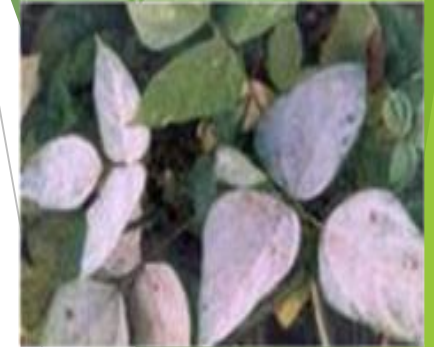
Powdery mildew of pea ( Erisiphae polygoni )