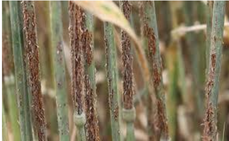
Fig. 7.2. Black rust of Wheat

E.g Black rust of Wheat ( Puccinia graminis tritici ), Pea rust ( Uromyces fabae )