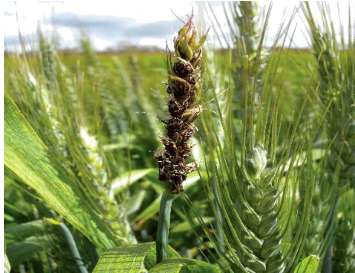
Fig. 7.3. Loose smut of Wheat

E.g Loose smut of Wheat ( Ustilago nuda tritici ), Whip smut of Sugarcane ( Ustilago scitaminea ) and Leaf smut of Paddy ( Entyloma oryzae )