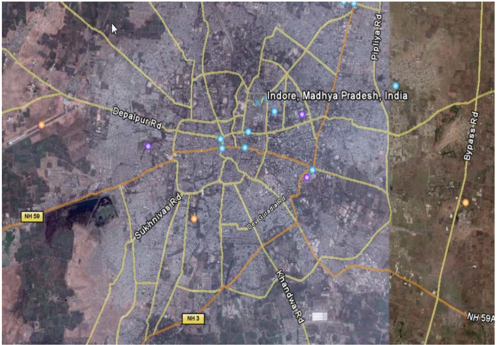
Layout of Indore