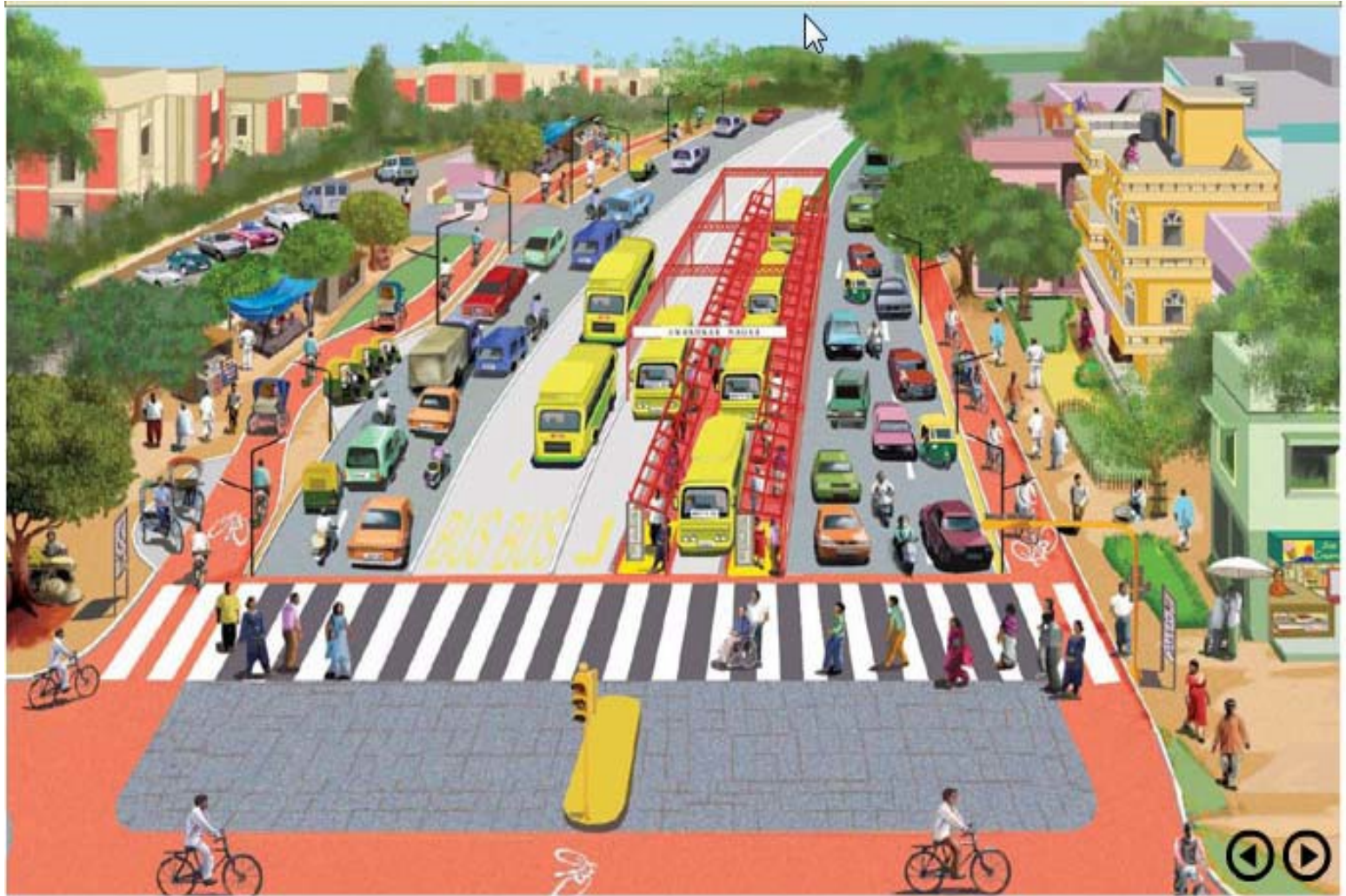
Intelligent Transport System