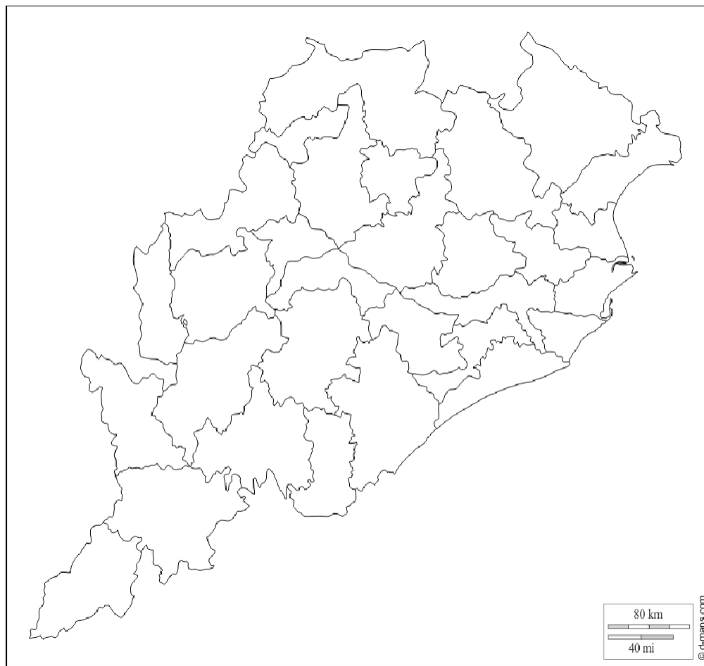
Figure 5.2 : Point out the Agroclimatic zones of Odisha in the map

India is divided into 15 major Agro Climatic Regions/Zones. Odisha falls under Agro-Climatic Zone VII. Further, the state of Odisha has been divided into 10 Agro-Climatic Zones based on the basis of soil structure, humidity, elevation, topography, vegetation, rainfall and other Agro-Climatic factors.