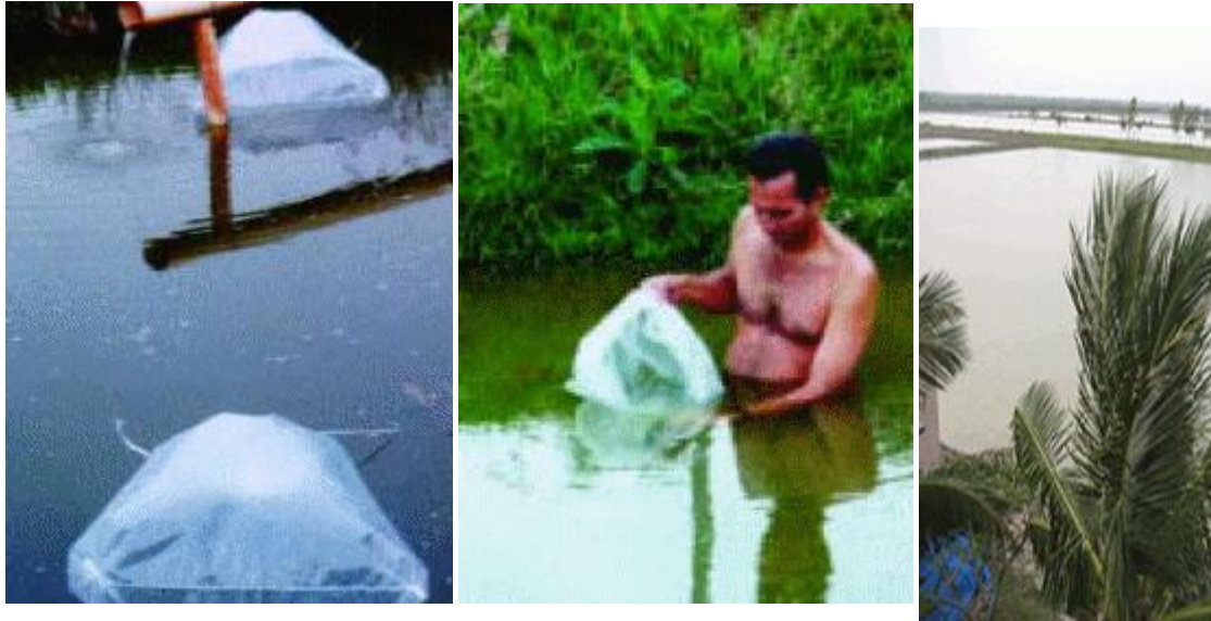
Acclimatization with pond water temperature and release of juveniles into grow-out ponds

In addition to feed, suitable water conditions also required for better growth and survival i.e temperature 26-32°C, pH 7-8.5, DO > 2.5 ppm, total hardness 100-150 ppm, calcium 30-80 ppm, phosphorus 0.01-0.9 ppm and nitrogen 0.05-0.5 ppm. Any imbalance of these parameters affects the growth as well as production. Prawn being a bottom dwelling animal, the optimum growth and development depends upon the pond soil, which should be alkaline. Therefore to make soil fertile, fused lime should be applied.