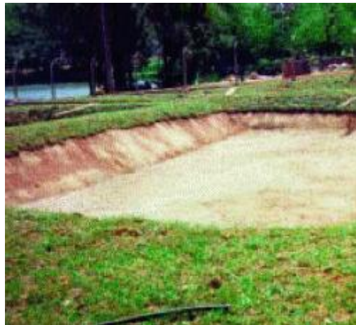
Farm construction with appropriate depth and dyke height

Selection of suitable site is pre-requisite for establishing a prawn farm. Farming site should be connected to approachable road for transportation of seed, fertilizers, feeding materials, farm equipment. Soil and water testing may be carried out before farm construction for assessing the productivity status, water holding capacity of the soil. Sandy-clay or sandy loam soil is suitable. For establishing the prawn farm the pond should be prepared in such a way that entire water may be drained out. The pond size can ideally vary between 0.1 and 1 ha area. Since prawns are migratory in mature, they try to migrate from one pond to other during rainy days and cool weather.