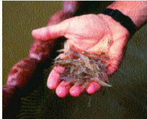
Juveniles of M. rosenbergii

becomes juveniles, they should be reared in low saline water of 3-7‰. Before stocking of juveniles in rearing ponds physico-chemical parameters of the water like Dissolved oxygen, temperature, pH, \text{NH}_4 , \text{Ca}^{+2} , and \text{Mg}^{+2} should be analysed and need to be kept within desired limit. Depending upon the water volume 5-10 PL/lit should be stocked for 2-4 weeks. During this period provision of shell strings has to be made so that they can hide while moulting. Groundnut oilcake, small mussel, chicken feed, fish meal with 30-40% protein may be used as feed. Juveniles attain 40-60mm within a rearing period of 2-4 weeks,