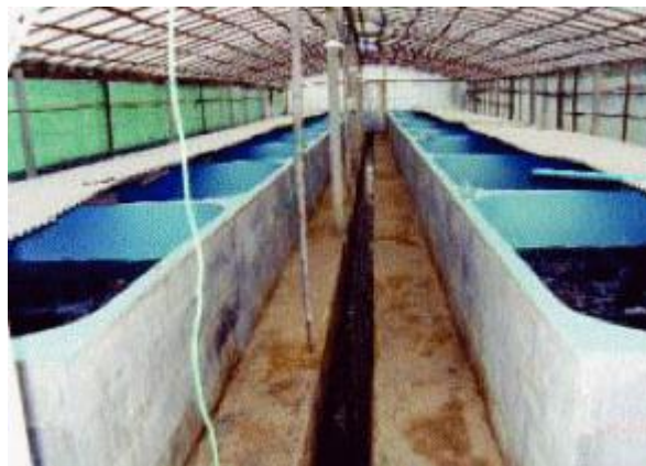
Concrete tanks for nursery phases

It is observed that releasing the post-larvae directly into the pond results in poor survival, emphasizing raising the PL in nursery pond till 30-50mm.