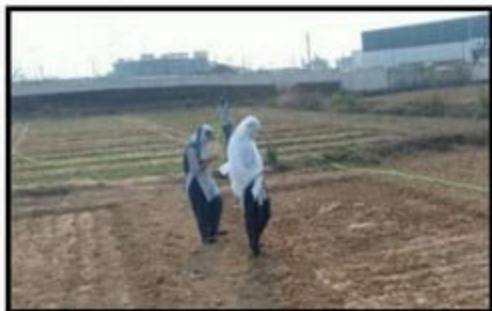
Plant Population Count