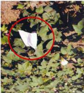
Dusted flower bud covered with white paper bag