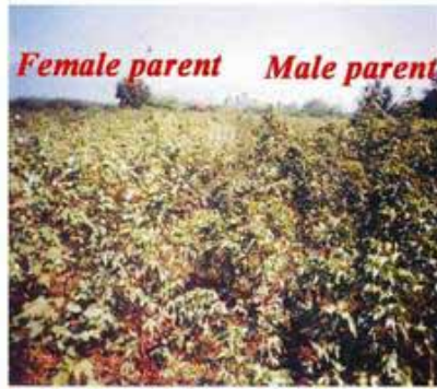
Hybrid seed production field