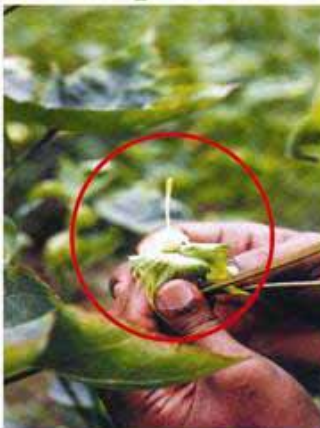
Stigma after dusting