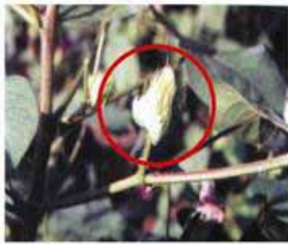
Female flower bud