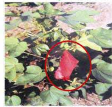
Emasculated flower bud covered with red paper bag