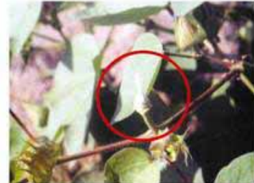
Emasculated flower bud