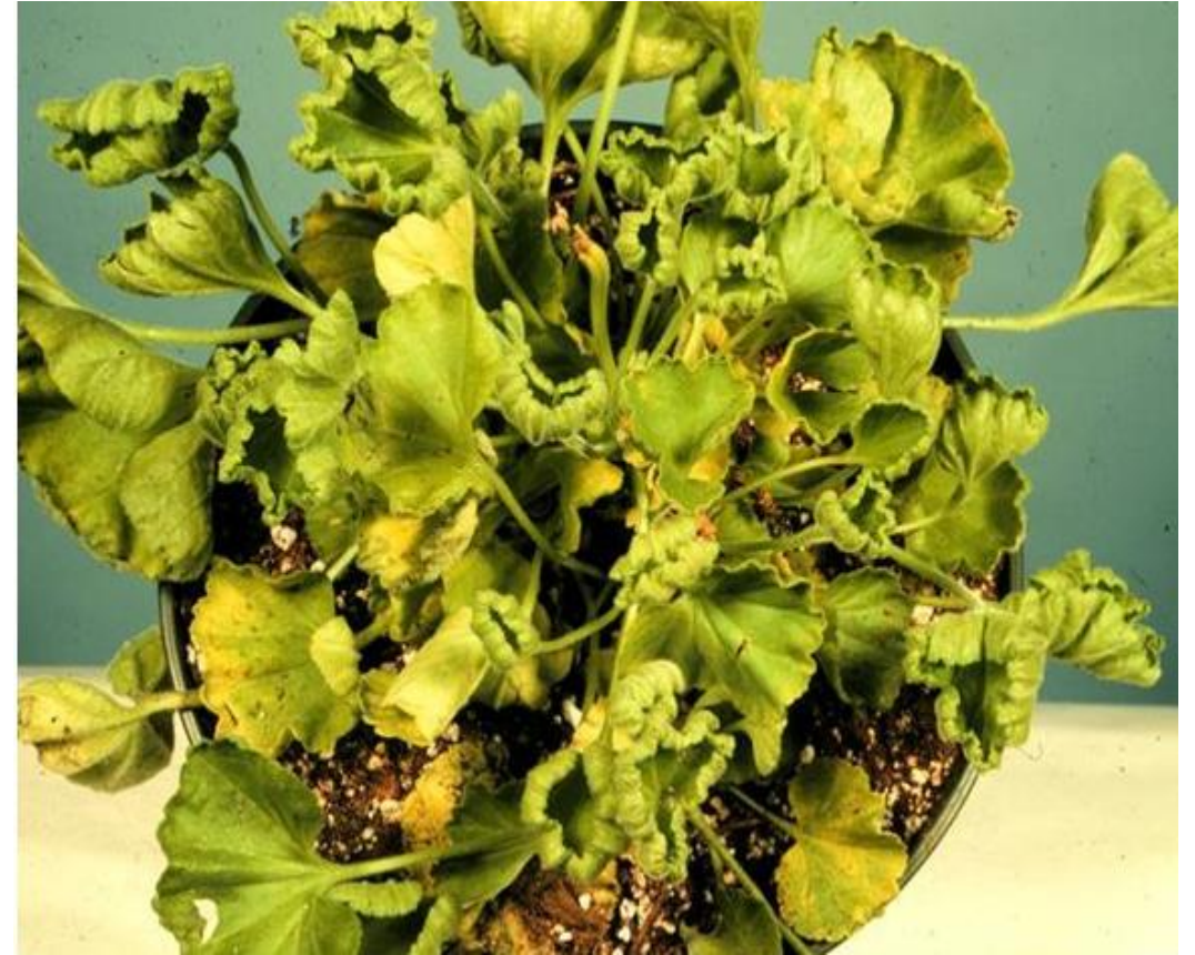
Curling and cupping of leaves