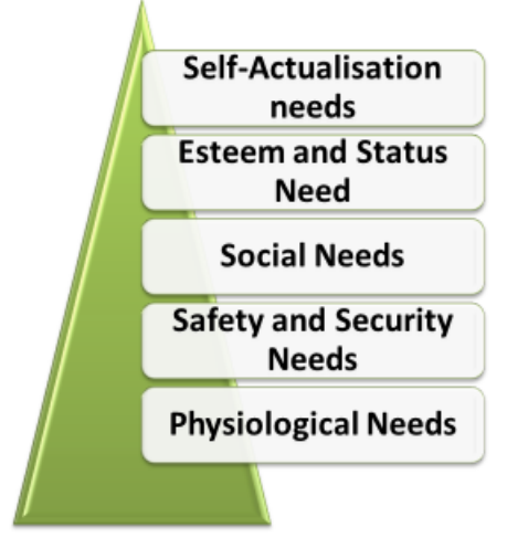
Maslow's Need Hierarchy theory

Behaviour is an organism's activities in response to external or internal stimuli, including objectively observable activities, introspectively observable activities, and nonconscious