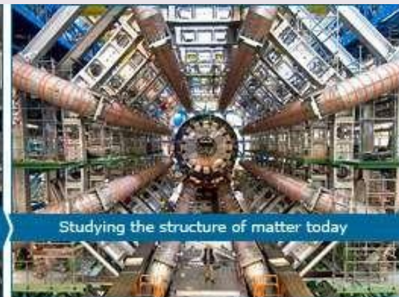
Studying the structure of matter today