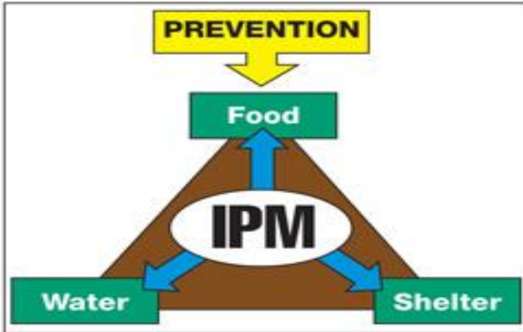
Figure 1: Pest Prevention: Controlling Food, Water and Shelter