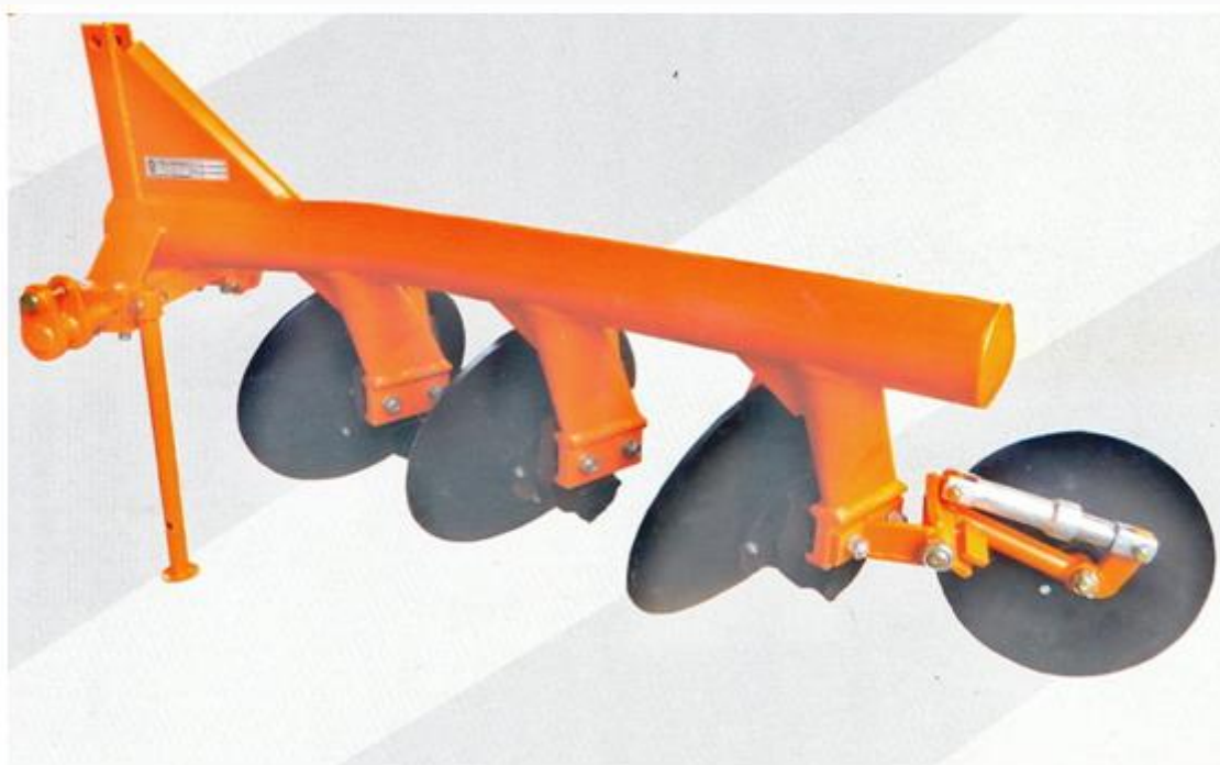
Fig. 1. View of Disc plough

A Disc plough consists of a series of individually mounted, inclined disk blades on a frame supported by furrow wheel. A tractor –mounted disk plough has only a rear furrow wheel. Disk ploughs are most suitable for conditions under which mould board plows do not work satisfactory, such as in hard, dry soils, in sticky soils where a mould board plow will not scour, and in loose, push-type soils such as peat lands. A mould board plows, in soils and moisture conditions where it works properly, does a better job than a disk plow and has a lower specific draft.