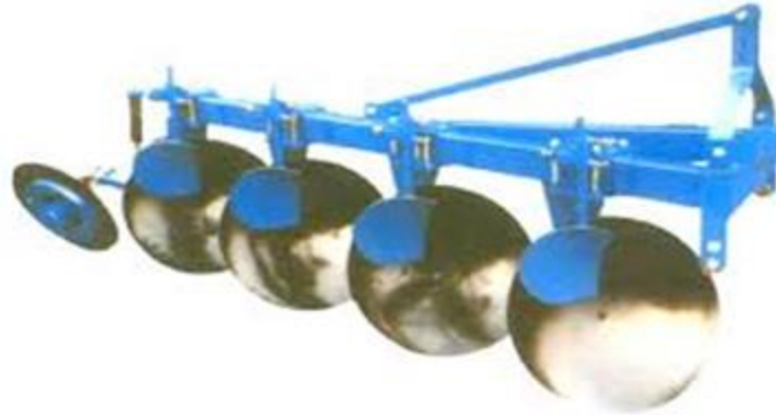
Fig: 2. View of disc plough having scrappers on it