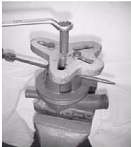
Fig: 7. View of water pump usually installed on tractor

10. Loosen the vent plug and the drain-tap of the primary fuel filter and run off a small quantity of fuel in order to remove any water which might have accumulated.