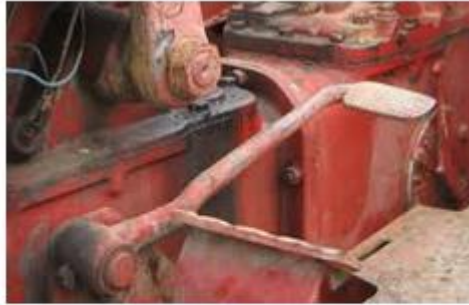
Fig: 6. View of clutch pedal arrangement