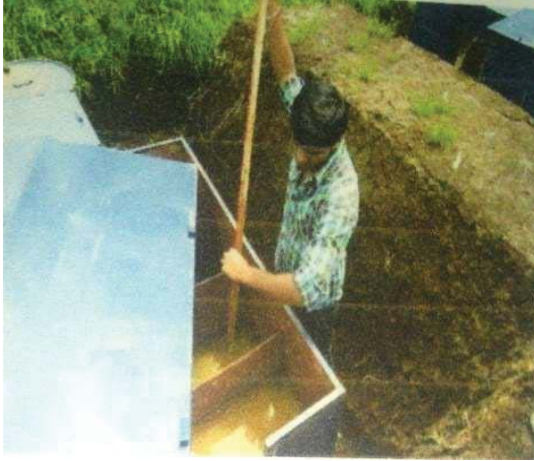
Fig.7.6 Measuring height of runoff