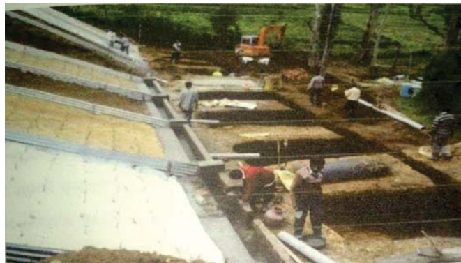
Fig 7.5 Runoff Channels

The pit was made of size 3.6m x 1.4m to install runoff tank. The cistern tank was also installed in this pit by extending the length of the pit. The collection tank installed in the pit it is divided into 4 compartments as shown in figure. Then runoff tank is connected with slot divisor to collect excess runoff into cistern tank.