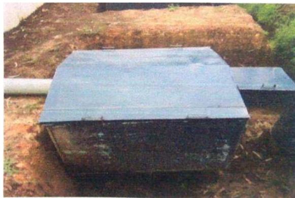
Fig.7.1 Collection Tank

The tank has 4 compartments of different dimensions. The dimensions of collection tank are 1.5m x 2m x 0.62m. The collection tank is provided with roof cap to avoid rain water falling into the tank. The collection tank is provided with a provision to attach slot divisor it first compartment filled with runoff water then passed to next compartment. For this purpose, compartment partition wall having openings at 30 cm from bottom of tank.