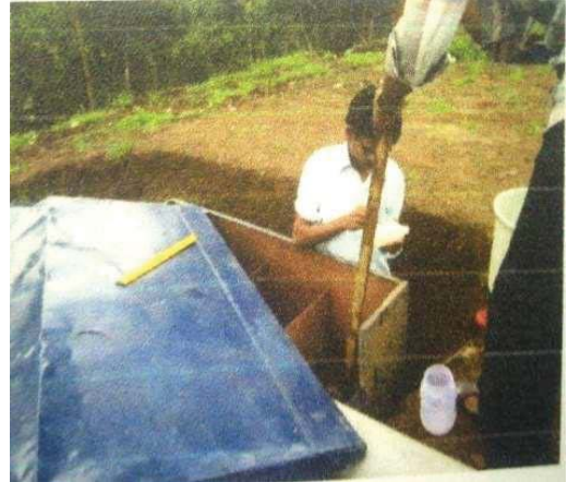
Fig 7.7 water stirring of runoff water