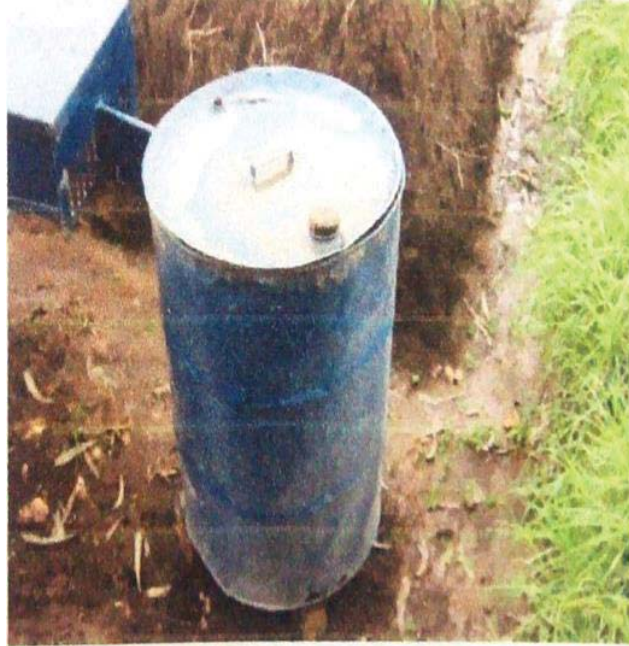
Fig.7.2 Cistern Tank

It is cylindrical shaped with a lid provided to the tank. The hole is closed using rubber cork. It is installed at height of 5-10 cm from ground to avoid corrosion. It is connected with the slot divisor. The capacity of drum is 500 litres with radius of 0.42 m and height of 0.90 m.