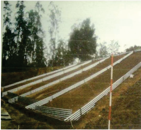
Fig 7.3 60% slope plot