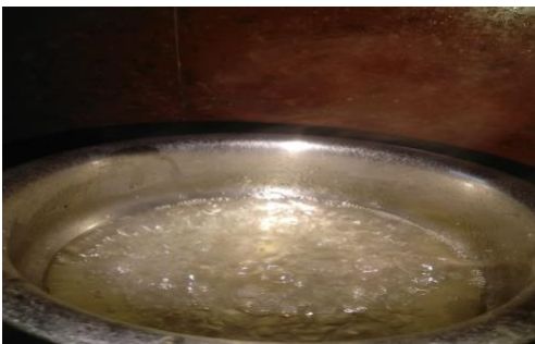
Preparation of sugar syrup