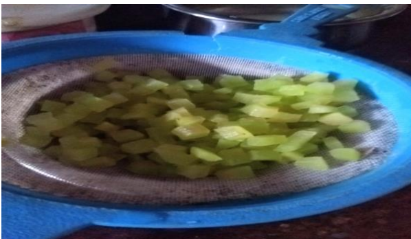
Staining of cubes from syrup