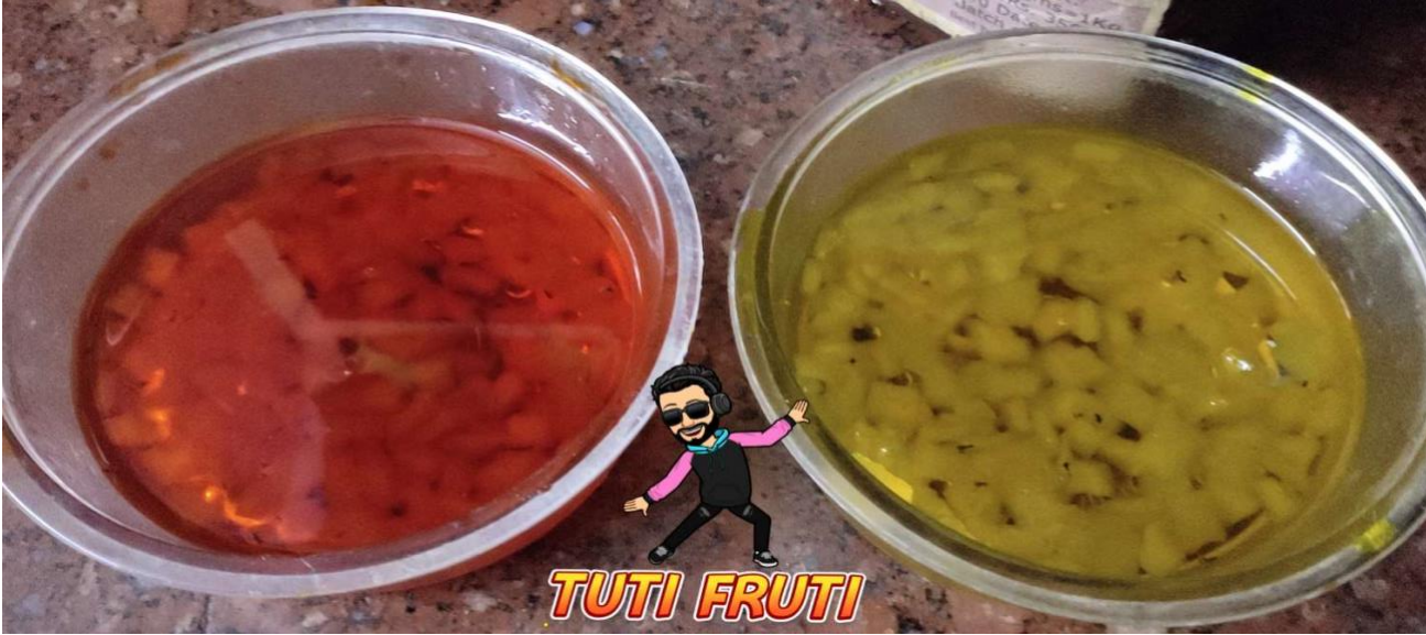
Adding of colors into the cubes