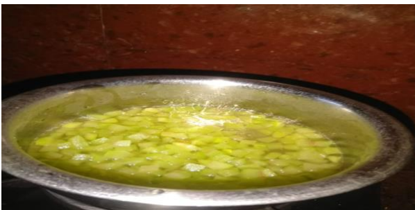
Adding of watermelon cubes in syrup