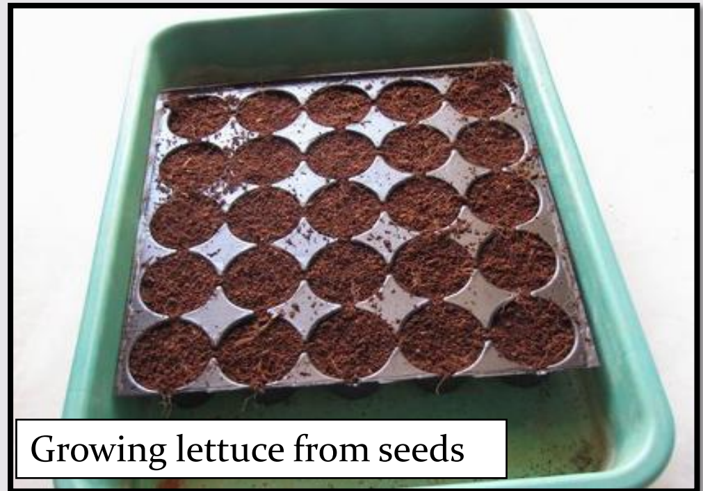
Growing lettuce from seeds