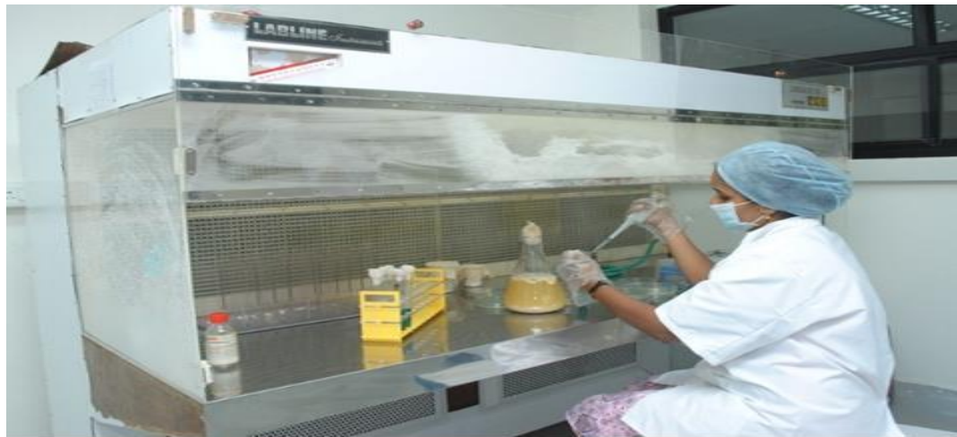
Laminar Air Flow