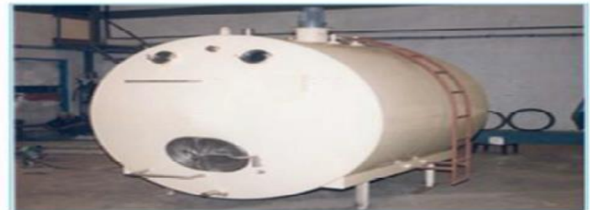
Fig. 23.5 Storage tanks for milk