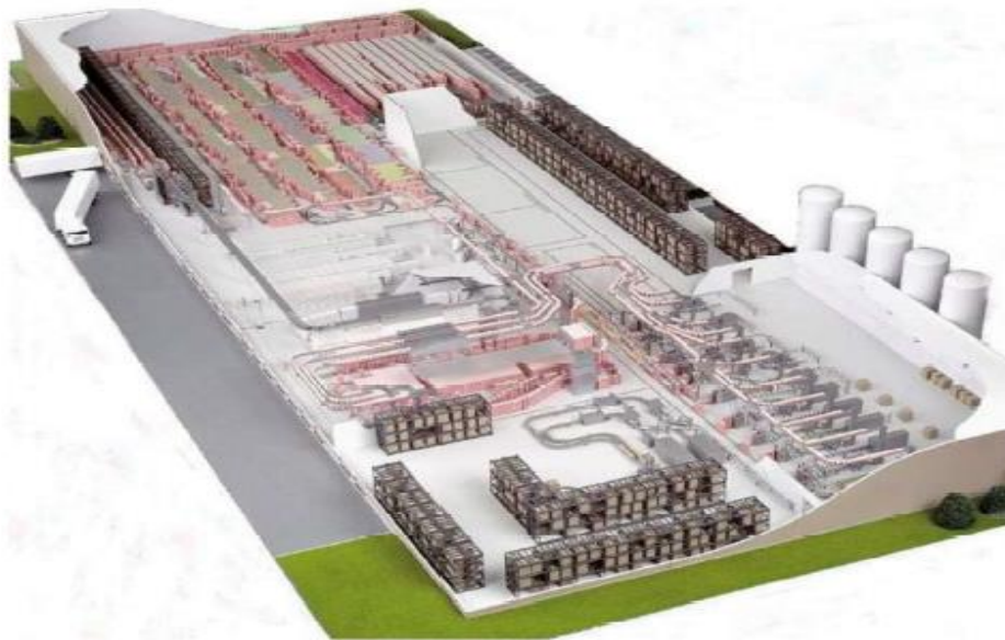
Fig. 23.1 Concept of material handling in the dairy plant

Material handling systems for dairy plant