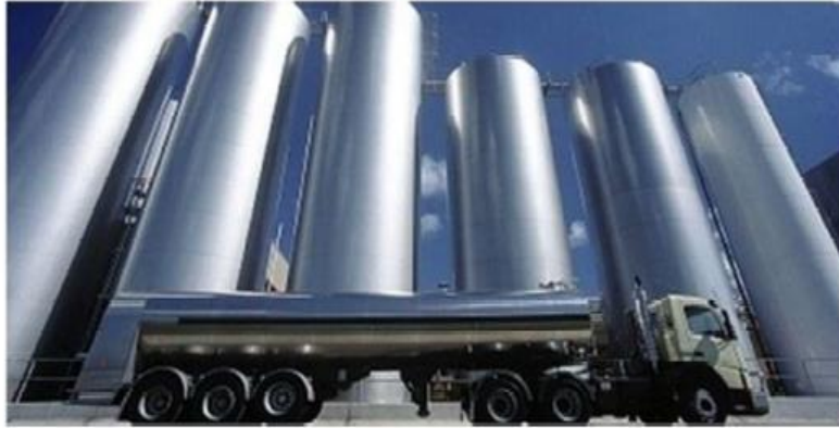
Fig. 23.6 Milk Silo