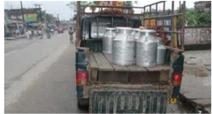
Fig. 23.7 Trucks handling milk cans