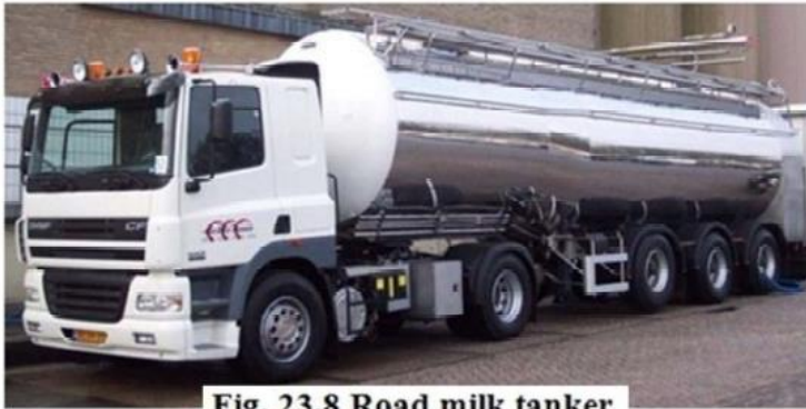
Fig. 23.8 Road milk tanker