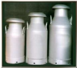
(a) Al-Milk Cans