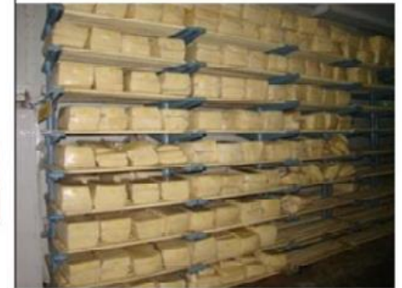
Fig. 23.9 Pallet for racking and stacking