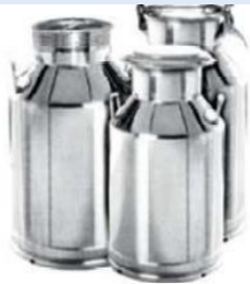
(b) S S Milk Cans