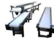
(b) Belt Conveyor