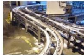
(a) Chain Conveyor