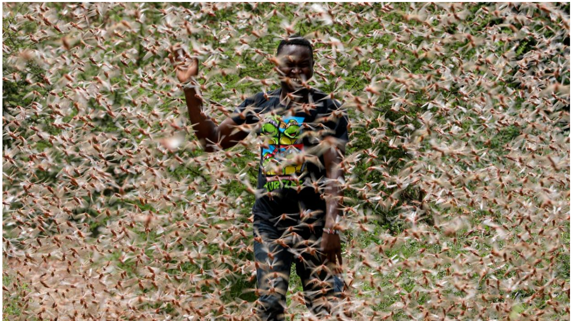
Fig: Locust swarm in Africa