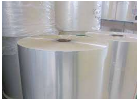
FIG -7 FOIL