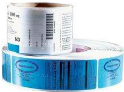
FIG -6 PAPER