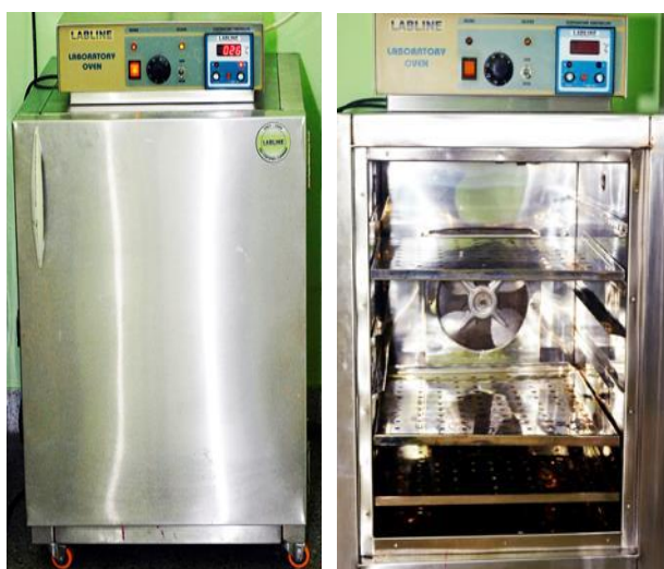
Fig. 3. Hot Air Oven

This is the most widely adopted method of sterilization by dry heat. The hot air oven utilizes radiating dry heat for sterilization. This type of energy does not penetrate materials easily and thus, long periods of exposure to high temperature are necessary. For example, at a temperature of 160°C, a period of two hours is required for the destruction of bacterial spores. Hot air oven is used to sterilize glassware, forceps, scissors, scalpels, glass syringes, liquid paraffin, dusting powder etc. A holding period of 160°C for an hour is used. The oven is usually heated by electricity, with heating elements in the wall of the chamber and it must be filled with a fan to ensure even distribution of hot air and elimination of air pockets. The materials should be arranged in a manner which allows free circulation of hot air in between the objects. It should not