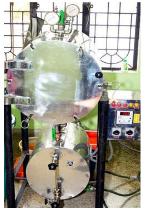
Fig. 4. Autoclave