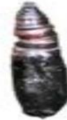
Pupa (7-8 Days)