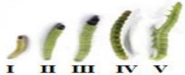
Larval instars (15-17 Days)