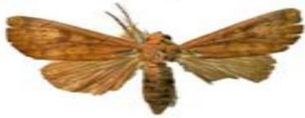
Adult (5-7 Days)