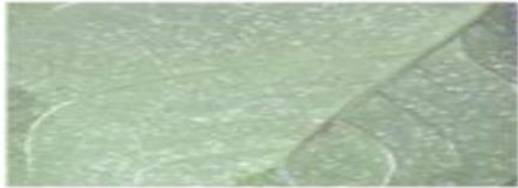
Egg (2-3 Days)