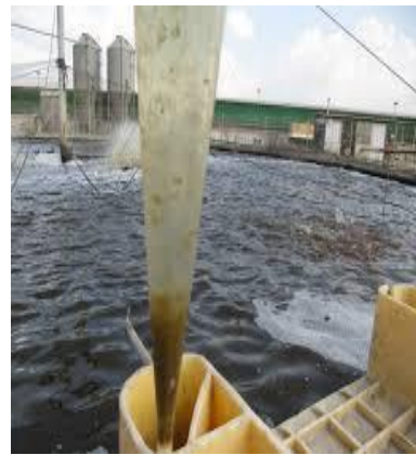
Biofloc collecting device