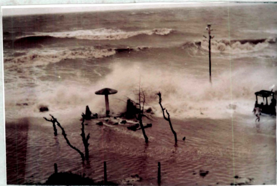
(Plate No. 6.1 STORM SURGE AT OLD DIGHA )