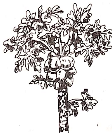
Figure 5.5: Plant of Carica Papaya