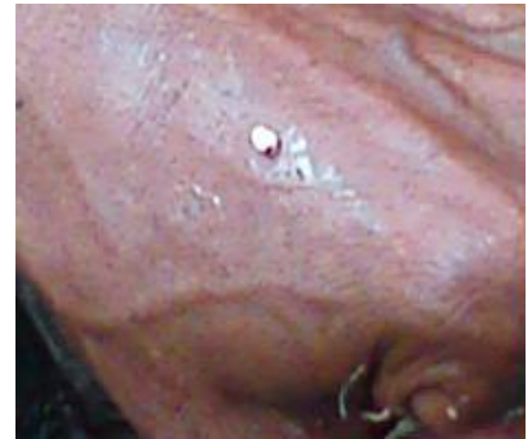
Figure: The pituitary mounted on to a hand