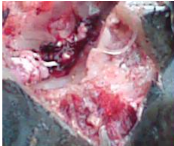
Figure: The pituitary seen as a small whitish body