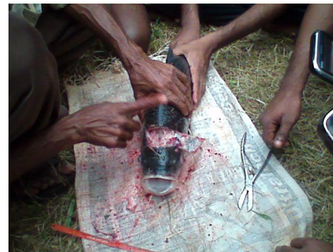
Figure: Fatty tissue and grey matter exposed