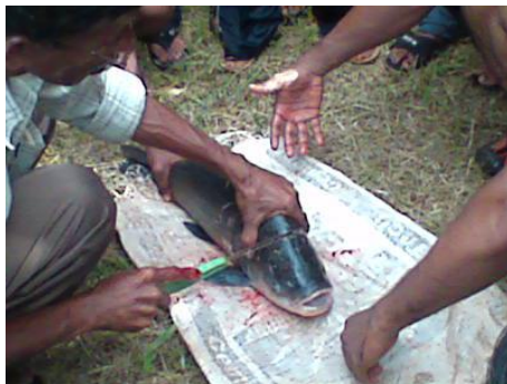
Figure: Making an oblique cut in the cranium