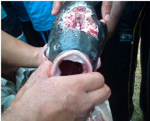
Figure: The brain being exposed