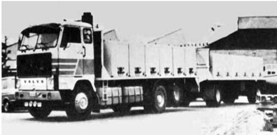
Installation of transport tanks on a truck. The transport capacity of the truck is about 8 000 litres; when the truck is combined with a trailer, the volume of the fish tanks is about 15 000 litres