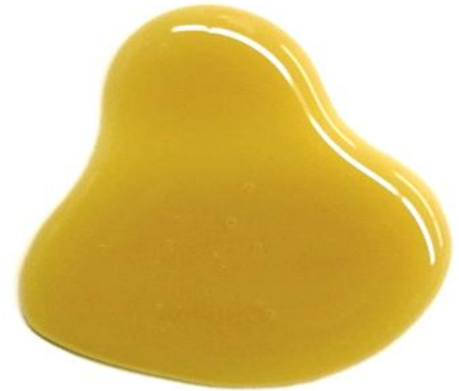
Fischleim, flüssig Fish glue, liquid