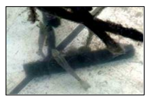
Shrimps grazing on substrate