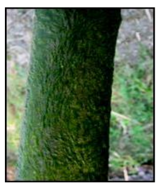
Periphyton on whole bamboo substrate