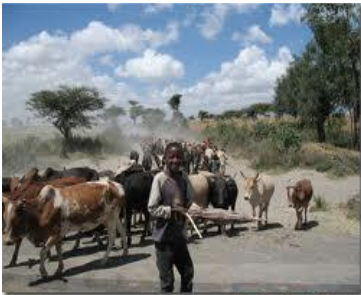
Young herd boy in Ethiopia