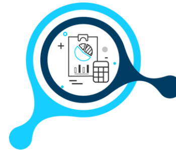
Exploratory Data Analysis