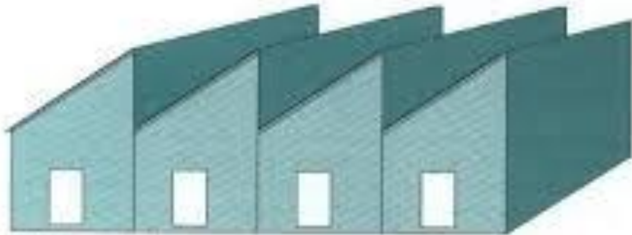
A saw-tooth greenhouse range.