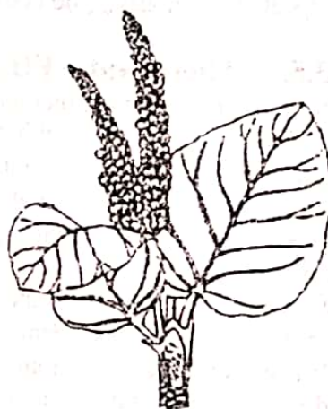
Figure 5.2: Twig of Rheum Palmatum

This species is distinguished from other Rhubarbs by its much larger size, shape of leaves, with their oblong, sharpest segments, and graceful looseness of its little panicles of greenish-white flowers. The first buds which appear in spring, are yellow coloured.