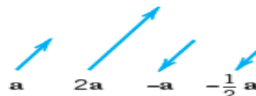
Fig. 175. Scalar multiplication [multiplication of vectors by scalars (numbers)]