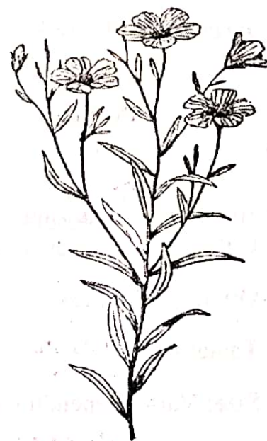
Figure 7.5: A Twig of Linseed Plant