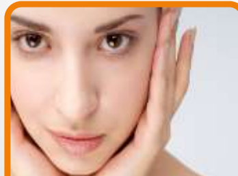
NAÏVE BEAUTY CONSCIOUS