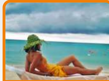
CONSCIENTIOUS SUN LOVERS