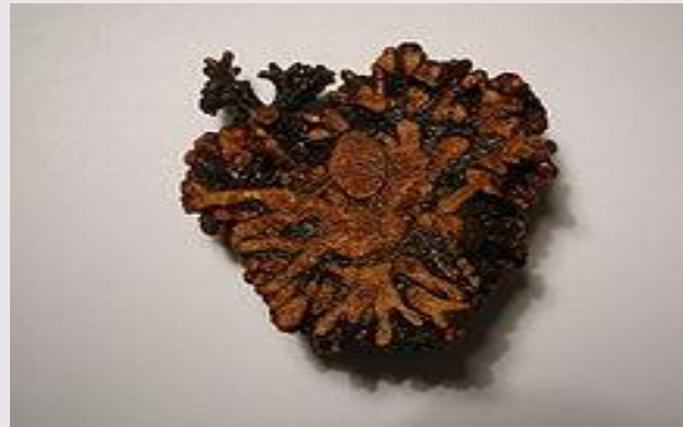
A sectioned alder tree root nodule.