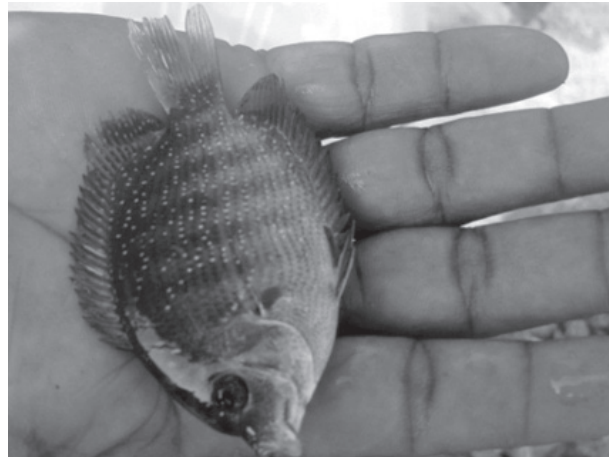
Pearl spot seed

easily increased without extra infrastructure. It can be done by any pearl spot farmer who can periodically collect egg masses from their own ponds or farms. This collection of eggs saves the parent fishes from extending parental care which in turn enables the next spawning in a shorter gap of time which increases the total seed production from a pair of brooders. In certain parts of Kerala there is a targetted fishery for Etroplus (mainly the guarding parents) during the breeding season using indigenous gears since they will not move away from their nests after spawning, even if their life is in danger. The fishers who take advantage of this parental care habit of Etroplus to fish it during night hours thereby