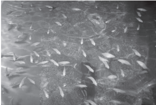
Pearl spot juveniles

easily increased without extra infrastructure. It can be done by any pearl spot farmer who can periodically collect egg masses from their own ponds or farms. This collection of eggs saves the parent fishes from extending parental care which in turn enables the next spawning in a shorter gap of time which increases the total seed production from a pair of brooders. In certain parts of Kerala there is a targetted fishery for Etroplus (mainly the guarding parents) during the breeding season using indigenous gears since they will not move away from their nests after spawning, even if their life is in danger. The fishers who take advantage of this parental care habit of Etroplus to fish it during night hours thereby